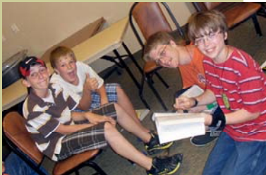
middle school camp '08

recreation. During the week, students were challenged to choose the narrow road and to live out the life Christ had modeled for us. We had 5 students accept Christ and over 30 that stood up and made commitments to devote themselves to grow their relationship with Christ. This was a unifying week for our middle school ministry that left us all changed.